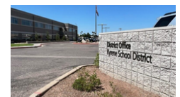
U.S. Department of Education Finds Arizona School District Failed to Stop Antisemitic Harassment