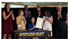
New York Governor Signs Legislation to Bolster Holocaust Education in State