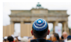
Germany Celebrates 1,700 Years of Jewish Life and Heritage