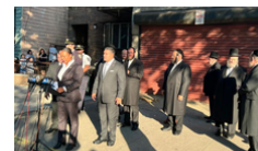
NYPD Steps Up Patrols Near Brooklyn Synagogues Amid Surge of Antisemitic Assaults