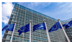
European Commission Celebrates First Anniversary of Launch of Comprehensive Antisemitism Strategy