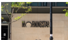
Morningstar Financial Services Firm Announces New Steps to Fight Anti-Israel Bias