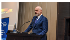
Albanian PM Rama at CAM Leadership Dinner: Biggest Danger Is From Those Who 'Rationalize' Antisemitism