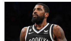
NBA's Brooklyn Nets Suspend Superstar Guard Kyrie Irving Over Promotion of Antisemitic Documentary