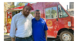
Five Positive Stories From the Global Fight Against Antisemitism in October 2022