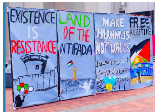
Temple University Israel Apartheid Week March 2023