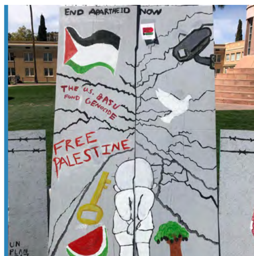
Arizona State University Israel Apartheid Week March 2023