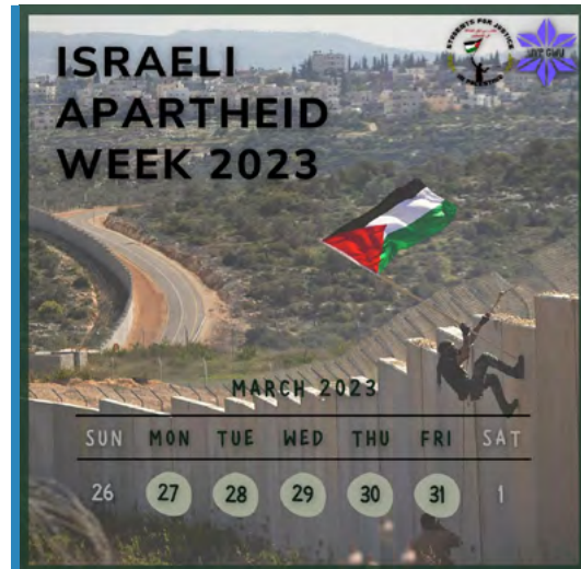
George Washington University Israel Apartheid Week March 2023

The strategy for these groups has been quite clear for some time: creating a litmus test on