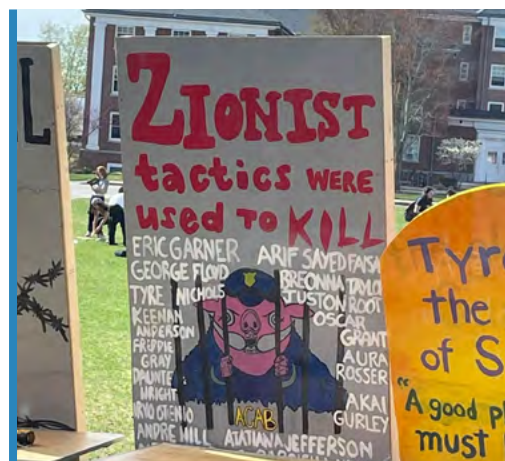
Tufts University Israel Apartheid Week April 2023