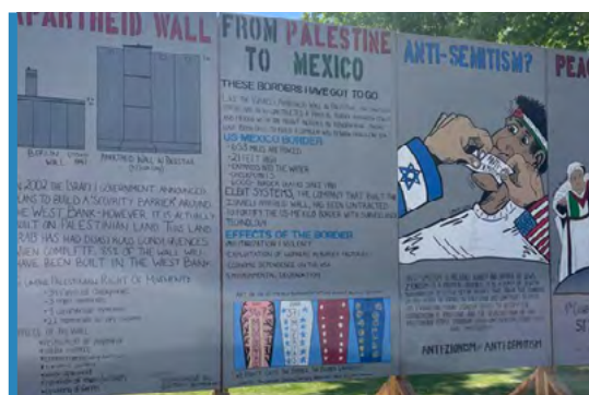
University of California San Diego Israel Apartheid Week May 2023

“If the refugees return to their homes [in Israel] as the BDS movement calls for, if we bring an end to Israel's apartheid regime and if we end the occupation on lands occupied