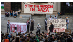
US House Committee Subpoenas Harvard Over Antisemitism Investigation