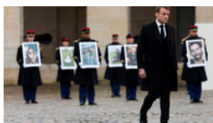
French President Macron Hosts Memorial for October 7th, the 'Biggest Antisemitic Massacre of our Century'