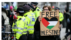
Britain's PM Vows To Crack Down On 'Antisemitism' And 'Violent Intimidation' At Pro-Palestinian Rallies