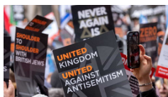
UK Government to Appoint Adviser to Tackle Antisemitism on Campus