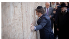
In First Bilateral Visit, Argentina's President Milei Says He Will Move Embassy to Jerusalem