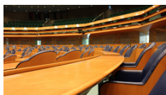
Motion Calling to Ban 'From the River to the Sea' Slogan Adopted in Dutch Parliament