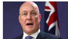
New Zealand Designates All of Hamas as Terror Group