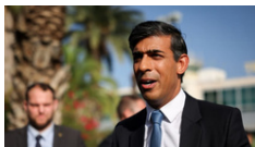
UK Unveils New Extremism Definition Amid Rise in Hate Crimes Against Jews, Muslims