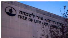
Tree of Life gets $1M in New Spending Law to Teach Antisemitism Prevention