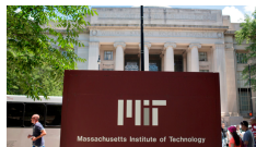
House Education Launches Formal Investigation into MIT Over Antisemitism Reports