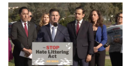
California Bill Would Let Victims of Antisemitic Flyers Sue Whoever Distributed Them