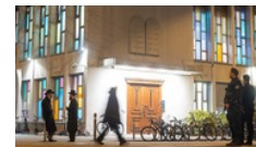
Swiss President Says 'Antisemitism Has No Place' in Country After Jewish Man Stabbed