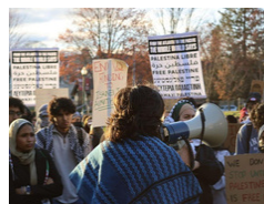
Hateful Antisemitic Acts Against Jewish Students Will Not Be Tolerated, Indiana Attorney General Todd Rokita Warns College Officials