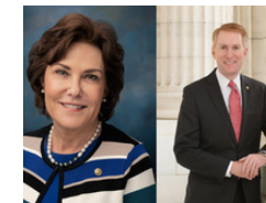
U.S. Senators Rosen & Lankford Press Education Secretary to Designate Official to Oversee Antisemitism Investigations