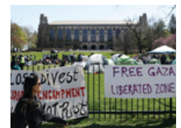
Rutgers, Northwestern, and UCLA School Leaders Grilled Over Campus Antisemitism At U.S. House of Representatives Committee Hearing