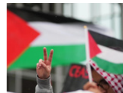
Germany Bans Group Supporting 'Palestinian Resistance'