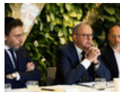
Australia PM Vows To 'Do More' To Tackle Antisemitism