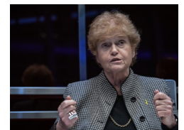
U.S. Presses Tiktok, Meta, X To Crack Down On Antisemitic Posts