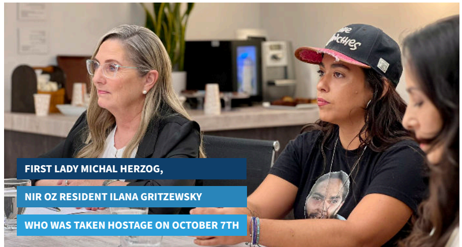
FIRST LADY MICHAL HERZOG,

A presentation was also made to Minister of Foreign Affairs Tinoco and his deputies on the importance of adopting the International Holocaust Remembrance Alliance (IHRA) Working Definition of Antisemitism.