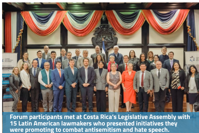
Forum participants met at Costa Rica's Legislative Assembly with 15 Latin American lawmakers who presented initiatives they were promoting to combat antisemitism and hate speech.