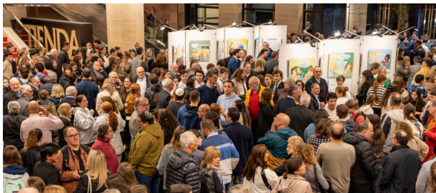
The “No Discriminarás” traveling art exhibit is seen on display at the Adela Reta National Auditorium, in Montevideo, Uruguay.