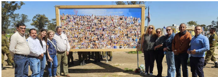
The delegation visits the site of the Nova music festival massacre.