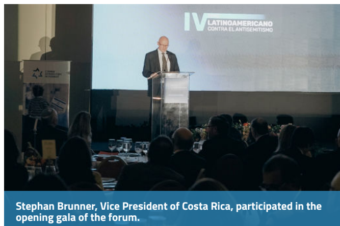
Stephan Brunner, Vice President of Costa Rica, participated in the opening gala of the forum.

Building on the success of last year's gathering in Uruguay, this year's forum, drawing participants from 19 countries, featured groundbreaking discussions on pressing challenges facing Jewish communities throughout Latin America, including the rise of global antisemitism following the October 7th attack on Israel and the growing threat of Iran and its terrorist proxies.