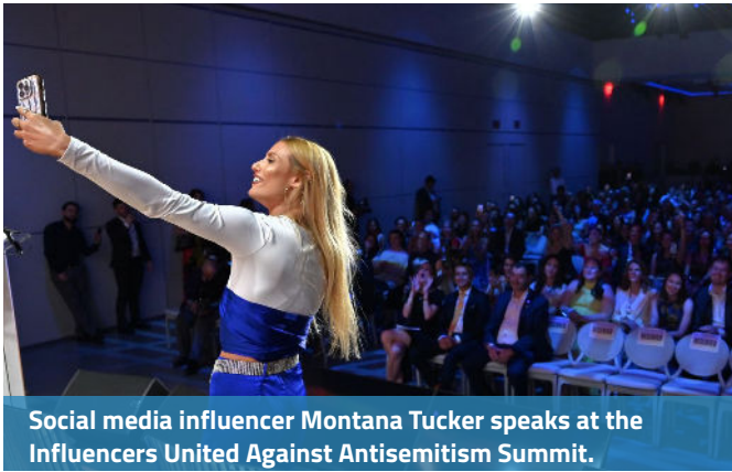
Social media influencer Montana Tucker speaks at the Influencers United Against Antisemitism Summit.