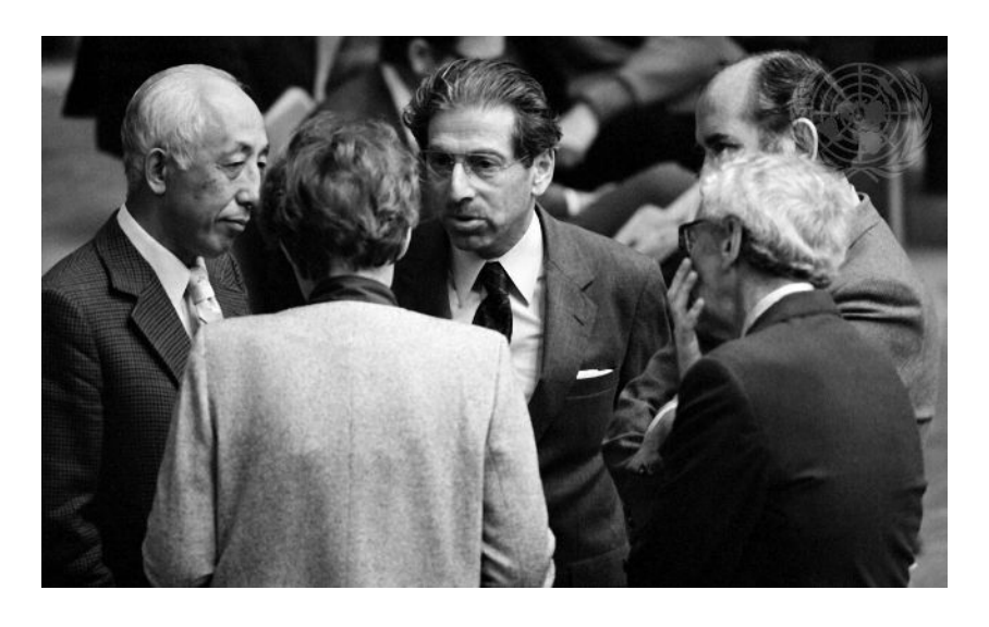
Yehuda Blum, Israeli Ambassador to the United Nations, June 1982

maps according to their expansionist plans. . . . What difference is there between the Israeli bloodbaths inflicted on thousands of innocent children and civilians in Lebanon today and the Nazi holocaust?"73