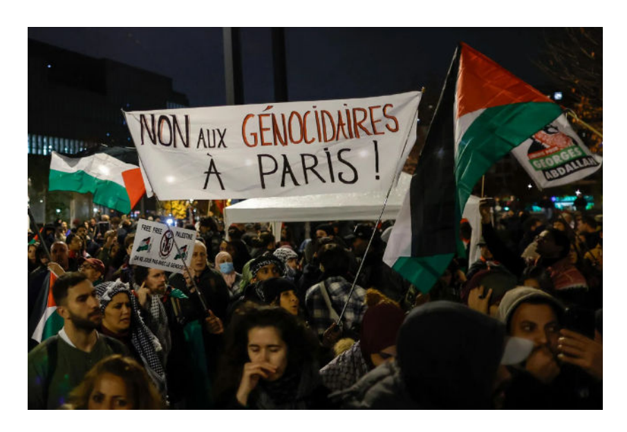
Demonstration before France-Israel Football Match, November 2024

the genocide convention was completed, we can begin to deconstruct the charge itself, how it has been used against Israel over time, and the stunningly bad faith behind the genocide accusation.