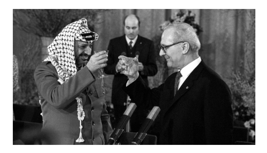
Yasser Arafat and East German leader Erich Honeker in East Berlin, 1982

ambitious stages were to flow from the initial aim and yet were to appear unplanned to the outside world. Sharon convinced Prime Minister Menachem Begin that the war would be over quickly.<sup>53</sup>